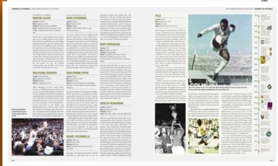
Unique and informative timelines and graphics