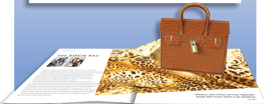
Bags To Love ©2010 Threefold Limited, London.